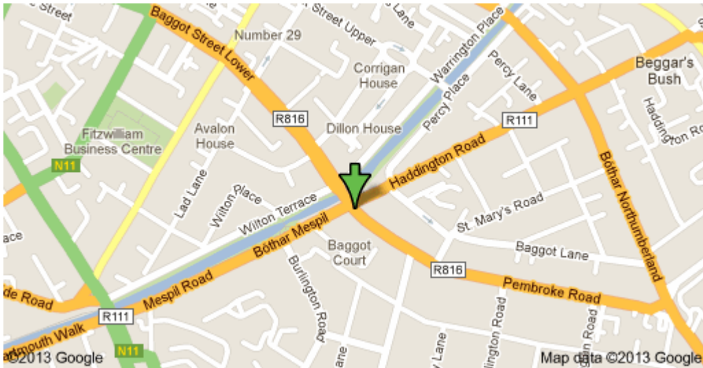
Maps taken courtesy of Google – above Baggot Street; below Upper Fitzwilliam Street